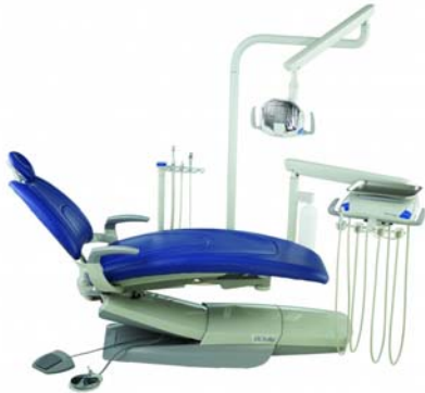
DCI - Ergonomic Chairs -

Replace your current inefficient water system with the fully automatic Dental Pure Water System , which produces 99.999999% Pure Water for the entire practice and eliminates headaches of repairs and chemical treatments.